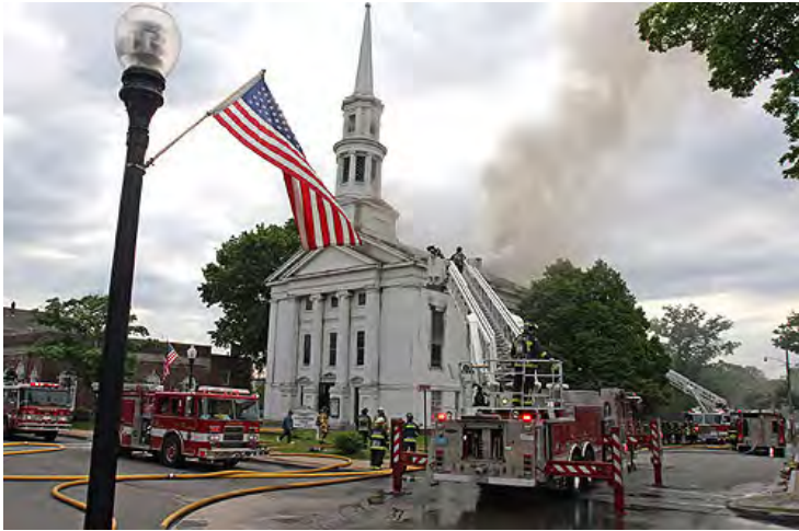
May 2009 Central Congregational Church of Middleborough Fire

They phoned him that day to say that they had voted to extend a call to him to pastor the church. They did not know that he had just given his church notice that he would be leaving. He himself was going not knowing.