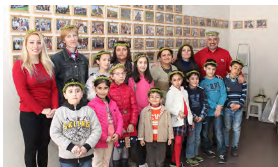
Kids' Planet Lesson: Jesus' Entry Into Jerusalem March 24