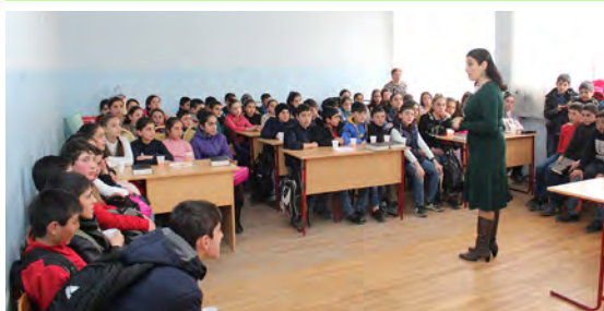
BASICS of Christian Faith youth program Tsovagyugh village school