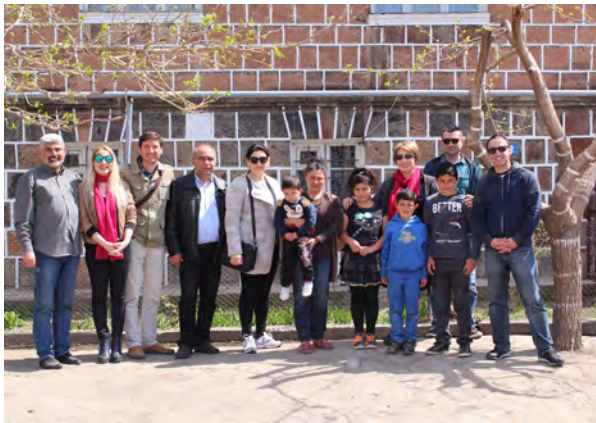
8 th Easter Outreach team visiting with one of the families Etchmiadzin, March 31