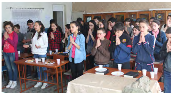
Follow-up FRUIT of the Spirit youth program Varsar village school

Hello still in this wonderful Easter season of joy and renewal! At the outset of our mission, our staff took the verse from I PETER (above) as our theme, making it clear that through the Resurrection of our Lord Jesus Christ from the dead, ours is a living hope! Now we have launched into the Book of ACTS during Monday afternoon staff Bible studies. Our prayer, as this verse from Chapter 4 (below) explains, is that the Lord will be at work powerfully in our ministries, and that He will receive the glory for what is accomplished.