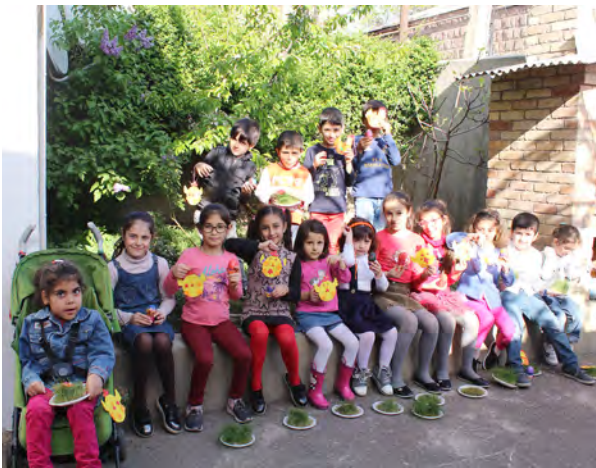
Kids' Planet Lesson: Jesus' Resurrection April 8