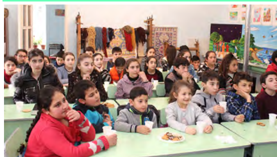
BASICS of Christian Faith youth program Idjevan City School